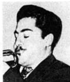
JIMMY ZITO nationally known trumpeter now with M.G.M. Studios in Hollywood and his Holton 45 trumpet.

An all purpose trumpet, Model 48 is particularly recommended for those who like plenty of power, unusual freedom of response and a big, yet brilliant, tone. Larger bore mouthpipe and bell give a little more power and a fuller tone than model 45. Yet it has a beautiful and exceptionally easy high register. Top action shrouded spring valves are very light and fast. Bore .459, bell diameter 4 13/16 inches, weight approximately 39 ounces.